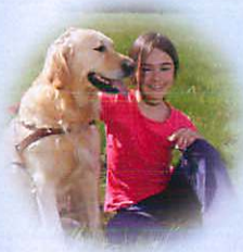
Children may be particularly vulnerable due to their close contact with pets, play habits and irregular hygiene.