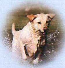
Any time your dog comes in contact with wildlife or their habitat, the risk of exposure to, and infection from, Leptospira bacteria increases.