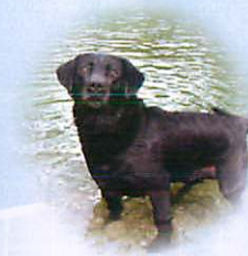
If you suspect leptospirosis in your dog, notify your veterinarian promptly to increase your dog's recovery success.