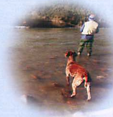
Any dog and human may be at risk to become infected. Even recreational activities like fishing or kayaking can potentially pose a risk.